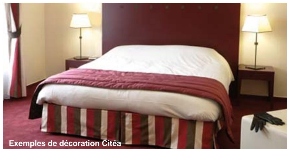
Exemples de décoration Citéa